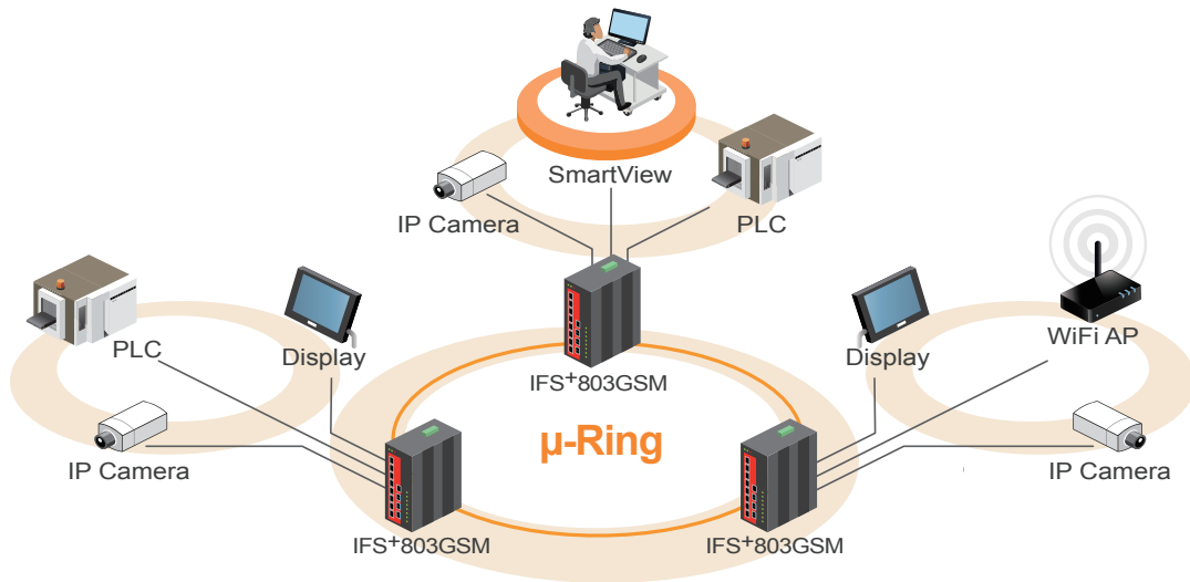
Figure : Application Example