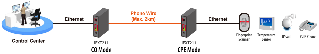
Figure 1 : Distance extend for Ethernet Application