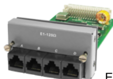
E1/T1 RJ-45 I/F