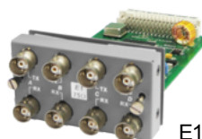
E1 BNC I/F