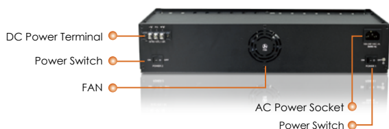
FMC-CH08 Back view